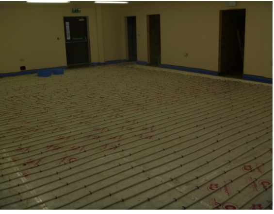
Underfloor heating installation