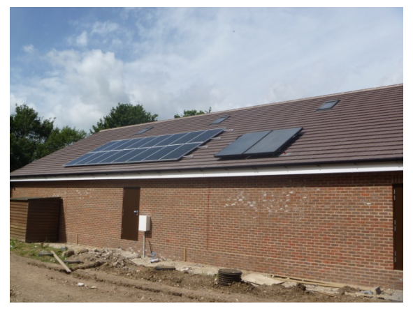
Above Solar thermal and PV panels