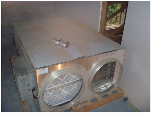
Recyc Ventilation plant