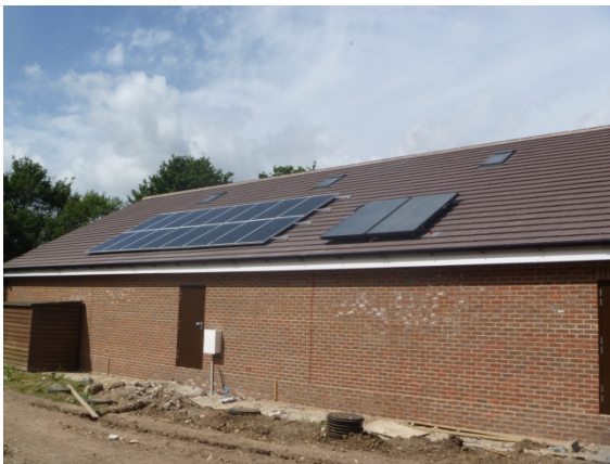
Above Solar thermal and PV panels