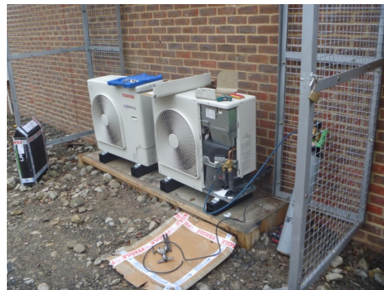
Air Source heat umps