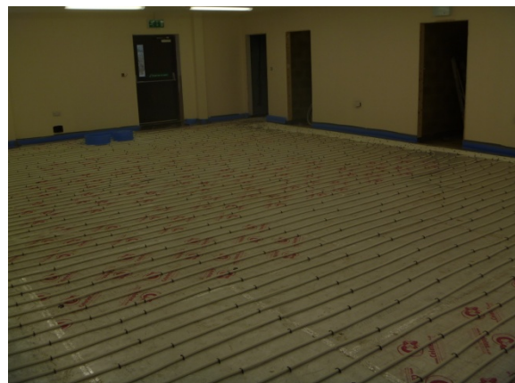
Underfloor heating installation