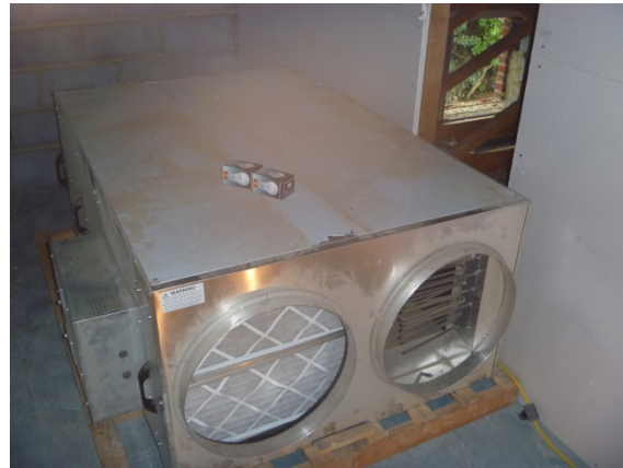
Recyc Ventilation plant