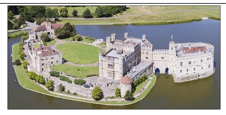
Leeds Castle 14 April walk

Walks usually start mid-morning. There's a short half-way break (bring refreshments) and we usually finish near a pub. Most walks are dog-friendly (see website).